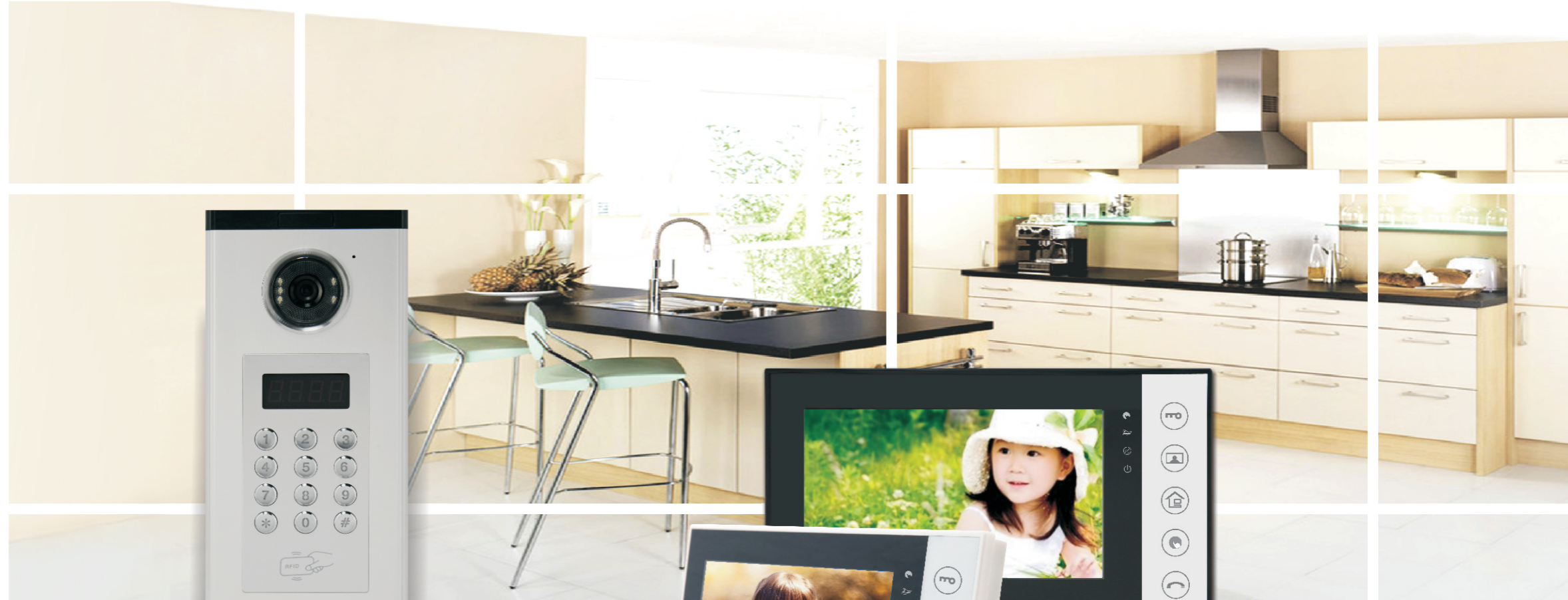
OP-D3D21 SIZE : 325*130*50MM